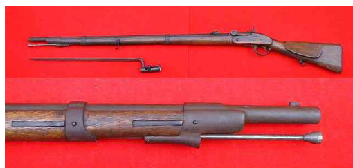
A Lorenz Musket. See http://www.sunblest.net/gun/Wanzl.htm

As you may know it was a common practice at the beginning of the war to arm New York regiments with two companies of rifles and eight companies of smoothbores. Obviously there was a lack of rifles and I don't think that we can assume that when the Springfield was replaced by the Enfield that the Lorenz was also replaced - but I suppose it was likely.