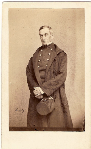
Anderson, shortly after Sumter

On Thursday, August 8, 1861, the Anderson Zouaves were presented colors on Riker's Island as a gift from General Robert Anderson. An article from the New York Times of the same day said: